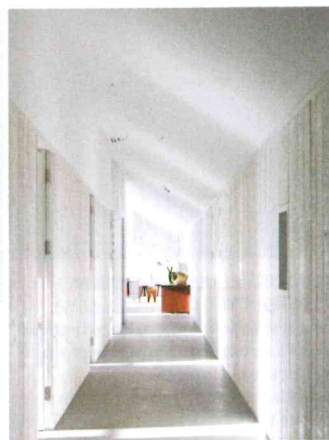
LEFT: JAMES BRITAIN RIGHT: WILL PRYCE

PRIVATE HOUSE, KENT HAMPSON WILLIAMS ARCHITECTS CLIENT: PRIVATE CONTRACTOR: QUBE SPECIAL PROJECTS CONTRACT VALUE: CONFIDENTIAL GROSS INTERNAL AREA: 335m 2