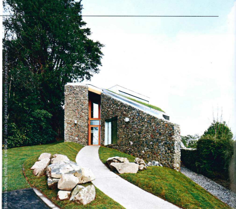
BROWN'S DENTAL PRACTICE, WYBRIDGE - DAVID SHEPPARD ARCHITECTS/JOAKIM BOREN