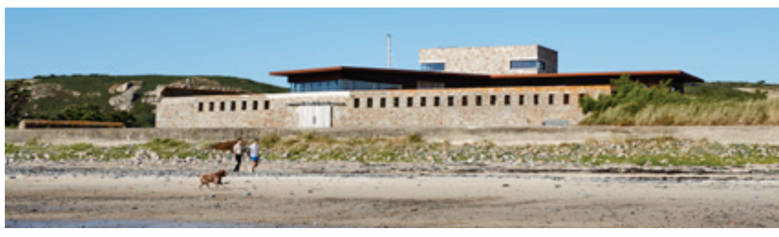
View of exposed location of Le Petit Fort from the beach

All the Schueco systems are doubleglazed and offer exceptional levels of insulation and water-tightness, both important factors given the property's exposed location. They also deliver the high level of security that brings peace of mind to home owners everywhere.